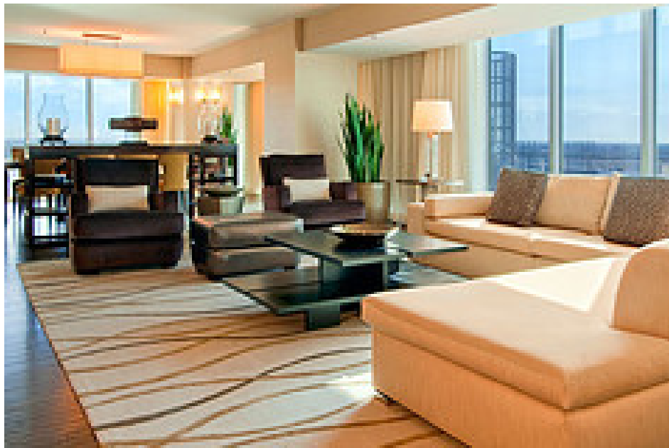
Figure 3: A Presidential Suite at the Hilton Hotel