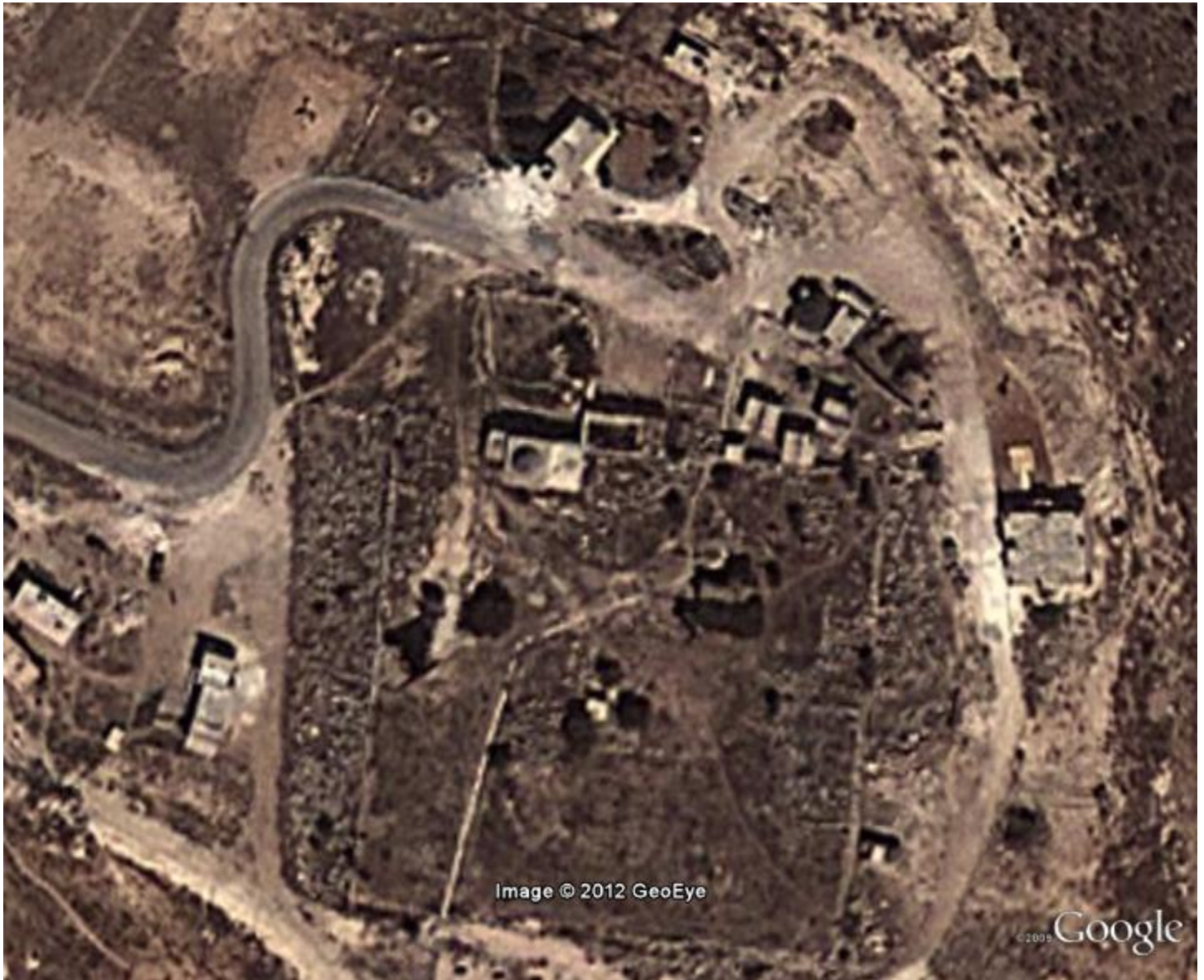
Chinese-sourced Type 120 radar deployed in Syria