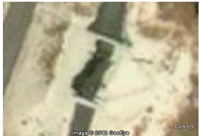
August 2010 imagery depicting a JYL-1 radar deployed atop a prepared berm at the Kafr Buhum EW complex

The JYL-1 is a 3D EW system featuring a 320-kilometer range. The 3D capability indicates that the radar is also capable of collecting altitude data on targets. As such, 3D EW radars such as the JYL-1 are significant components in any modern air defense network.