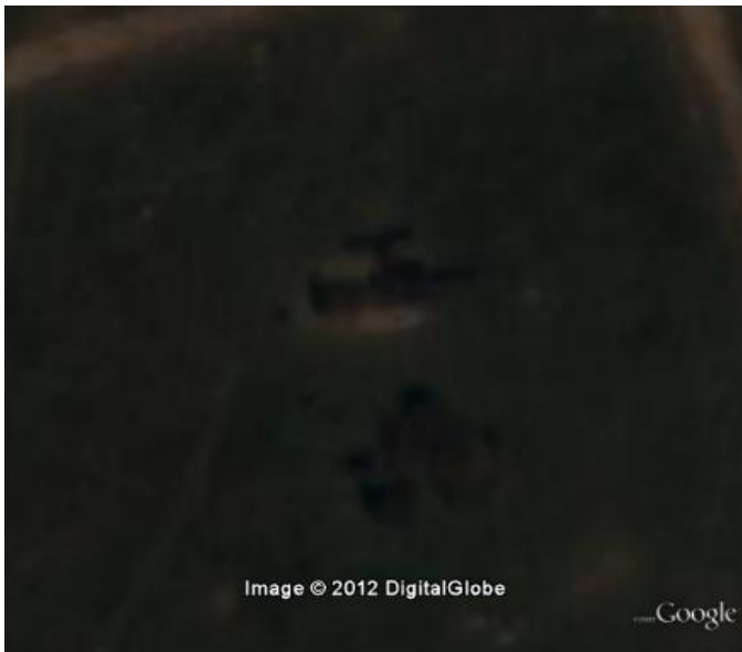
Type 120 radar deployed at the Tartus EW complex

South of Baniyas, the Tartus EW complex represents an additional facility capable of monitoring the eastern Mediterranean. A Type 120 radar is visible in imagery as early as June 2009. While the radar relocated between June 2010 and March 2011, it has remained consistently visible throughout.