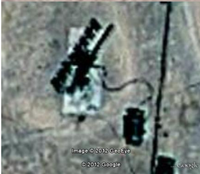
Palmyra (upper) and desert (lower) JY-27 radar installations