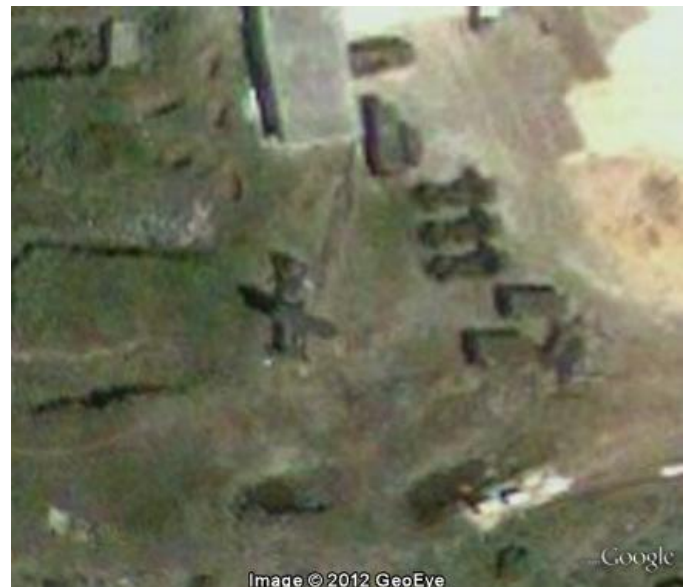
Type 120 radar visible at the Baniyas EW complex in April of 2010

The Baniyas Type 120 radar is present in overhead imagery captured in April of 2010. In June 2010 imagery, the radar is no longer visible. This potentially relates to the erection of a large geodesic dome on the site. The dimensions of the dome allow for the placement of the Type 120 radar under protective cover, explaining its apparent absence.