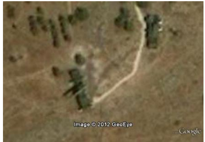
Type 120 radar deployed at the Kafr Buhum EW complex

The Kafr Buhum Type 120 first appears in imagery captured in August 2010, potentially making it the most recent Type 120 deployment. While the Tartus and Baniyas EW complexes do not appear to host other EW elements, the Kafr Buhum EW complex is home to an additional radar system.