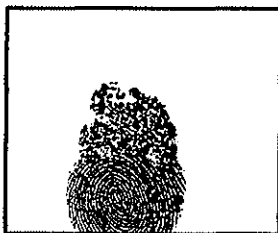
Defendant's Right Thumbprint